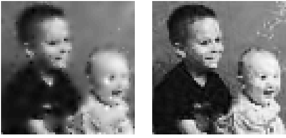
Figure 1: Anisotropic refinement atoms versus Isotropic Gabor atoms. Anisotropy (right image) gives better contour resolution.