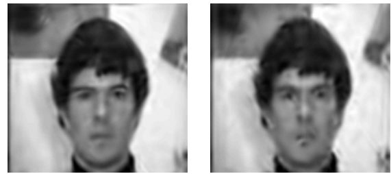
Figure 4: Comparison of two images having 420 coefficients. Left image is coded with the whole dictionary (PSNR=31.2294 dB), and the right one with a subset of 64 functions, learnt from MP decomposition of ten images (PSNR=29.2315 dB).

As the MP dictionary used here is highly redundant, some of the functions are hardly ever used, they can be rejected (as done by Neff and Zakhor in [11]). The rejection of these