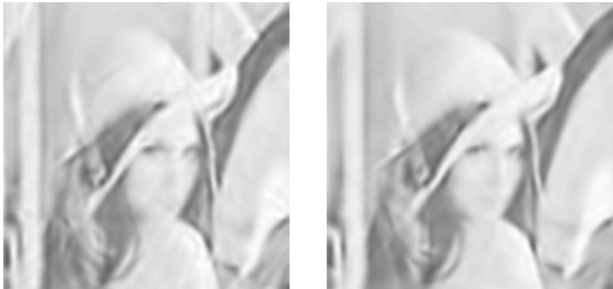
Figure 3: Comparison of two MP coded images. Left image has been coded with one layer MP (PSNR=25.7987 dB) and the right one with multiresolution MP (PSNR=26.0016 dB).

been chosen. In this scheme, the image is downsampled by two several times. The MP algorithm is first applied to the smallest image and when the desired number of coefficients in the lowest resolution layer has been reached, a recomposition of the next level image (double size) is performed. This recomposition is done by taking advantage of the dictionary covariance to dilations (see section 2.2). The subtraction of this recomposition to the next resolution level image is performed, and MP is applied to this residual (see scheme in Fig. 2).