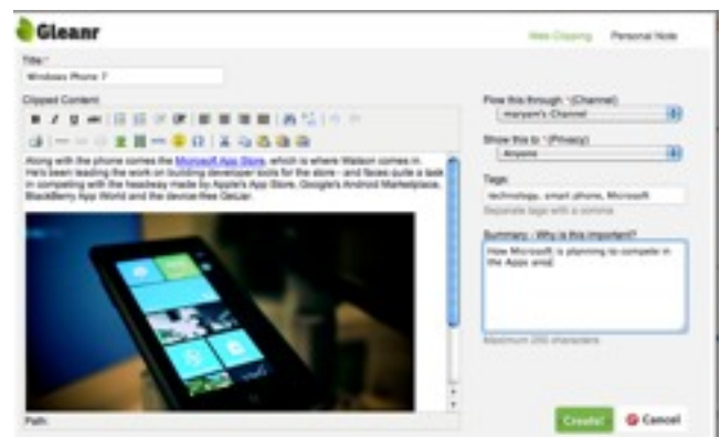
Figure 1. Capturing content as a "glean"

Upon finding something interesting or relevant to their current activity, users can select the exact content and add it to their Gleanr account by clicking the Gleanr bookmarklet on their browser (figure 1). At the same time, they can edit, tag, and set access rights on the captured content. As a result, not only the content will be saved in Gleanr, but also depending on how the user has set his/her account, the newly captured content will also update his/her tweeter, Facebook, and/or LinkedIn status. Users can also subscribe to the information streams of others if they are interested. Gleanr then aggregates, indexes, and networks all of one's captured or created information. Considering these functionalities, Gleanr can be used as a personal information management tool, a personal research assistant tool, a personal branding tool, or a collaborative tool. Figure 2 shows a screen shot of a series of "gleans" created by various users in Gleanr.